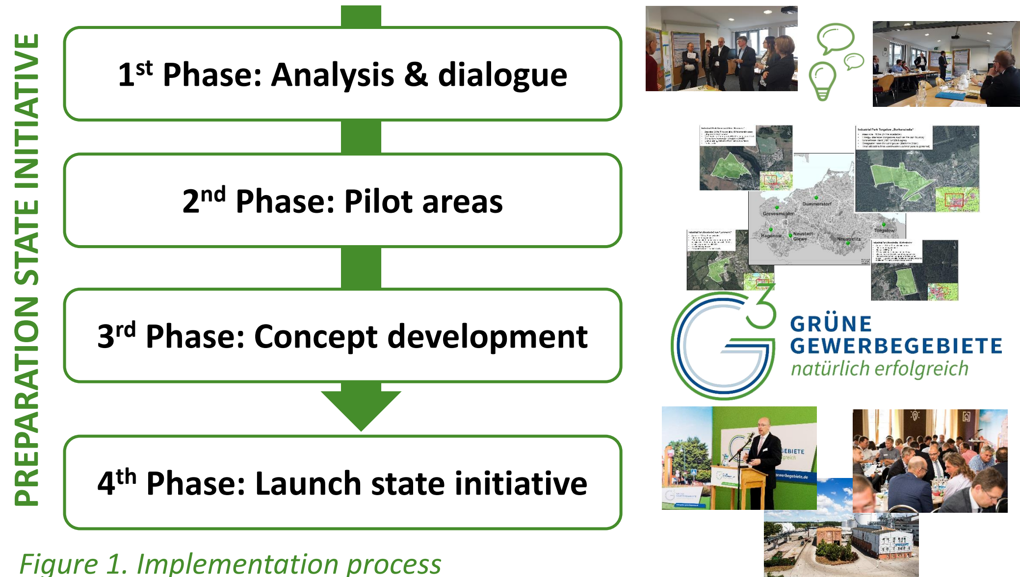
Figure 1. Implementation process