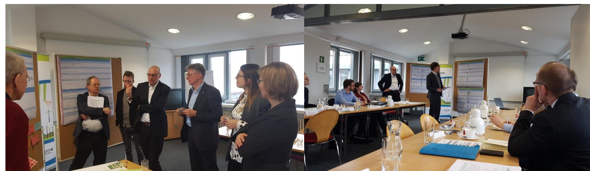
Figure 2. Workshop "Green industrial areas in Mecklenburg-Vorpommern"